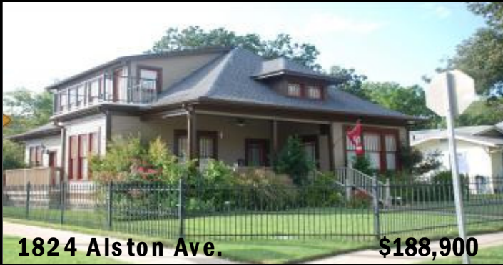
1824 Alston Ave. $188,900

Beautiful Fairmount home on corner lot with covered front porch and open side porch. Original hardwoods stretch throughout this spacious 4 bedroom, 2 1/2 bath home. Kitchen features tile flooring and gorgeous stainless steel Chef's stove with double side by side oven. Upstairs master suite has private balcony. For a private showing or more information, please call 817-737-8587.